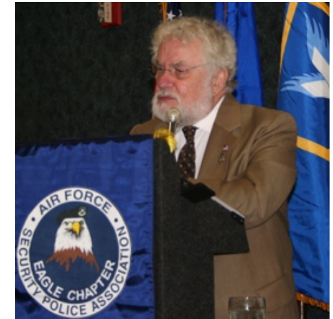
Adrian Cronauer "Gooooood Morning Vietnam"