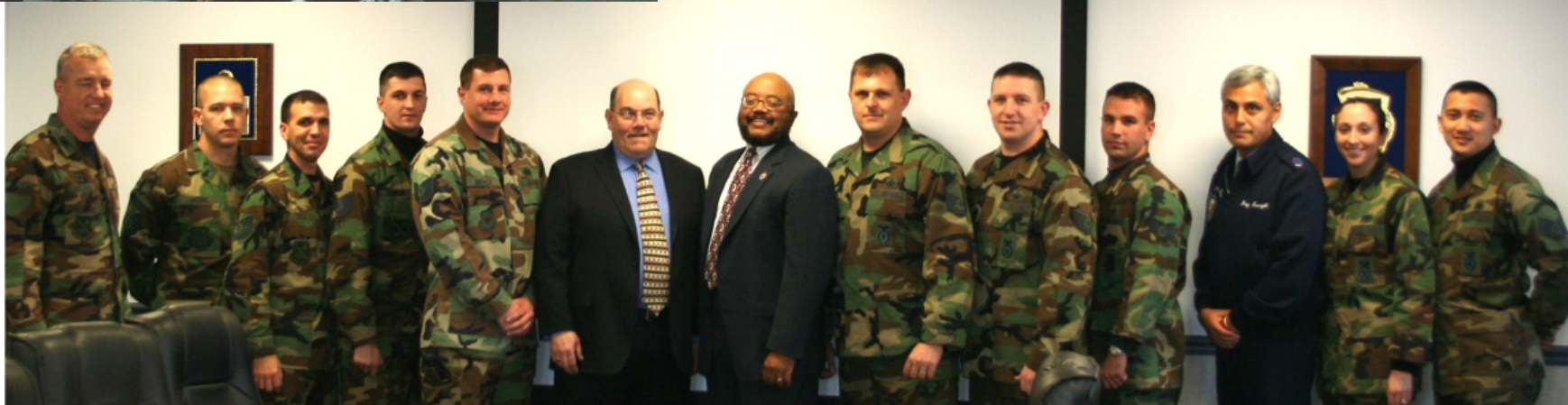
Sep 2006, Eagle Chapter with Andrews SF support hosts the AFSPA 20th Anniversary Meeting and Golf Tournament