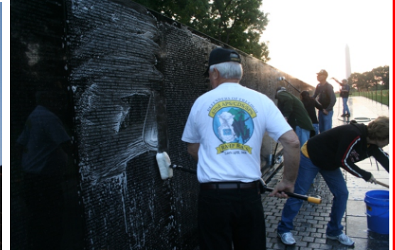
Vietnam Memorials Wall Wash