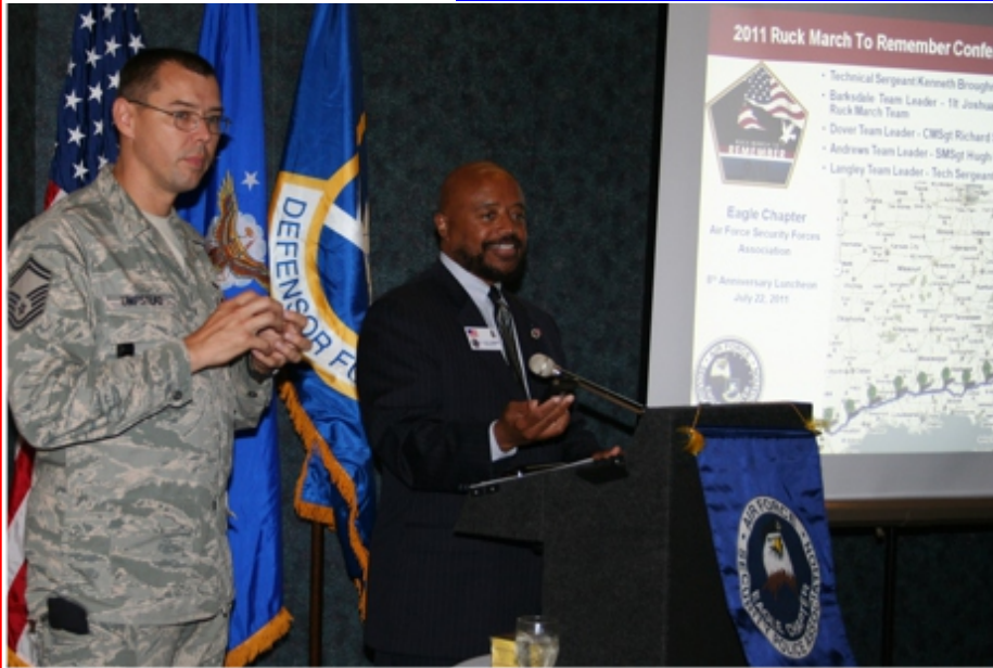
July 2011, AF Security Forces Ruck March to Remember 9/11 Conference Call where SF from Andrews AFB MD, Barksdale AFB LA, Dover AFB DE, Langley AFB VA, and Seymour-Johnson AFB NC participated.