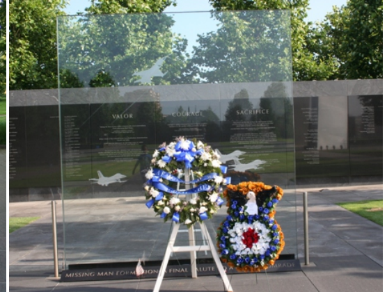
Defensor Fortis Flag Placement at Arlington National Cemetery and Wreath Laying Memorial Day and Veteran's Day: AF Memorial, Women's Memorial, Vietnam War Memorial, Vietnam War Women's Memorial, Korean War Memorial, and WWII Memorial