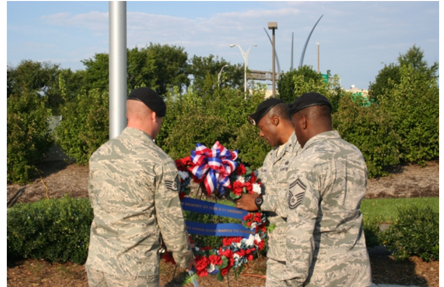
2011 10th Anniversary 9/11 Ruck March to Remember Flags, Route Change (Pentagon added) and Wreath Sponsorships - NY, Pentagon, and Shanksville PA.