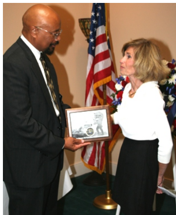
Sep 2010 Jacobson 5th Anniversary Remembrance and 1,000th Coin Sold