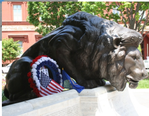
National Law Enforcement Officers Memorial