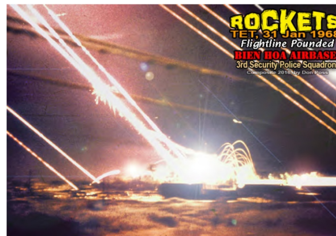
Bien Hoa AB: TET 0300, 31 Jan 1968. Incoming Rockets.