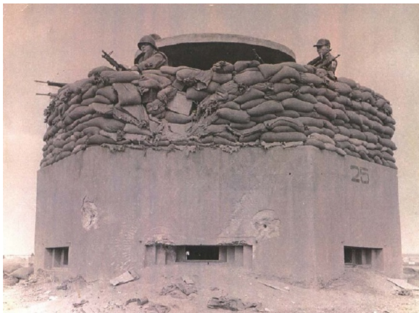
Bunker Hill 10 - Bien Hoa Air Base

To capture Saigon, enemy forces had to neutralize the two great Air Bases--Bien Hoa (pronounced Ben Wha) and Tan Son Nhut--near the city. Two infantry battalions and a reinforced infantry company were assigned the task of penetrating Bien Hoa's defenses and destroying US and VNAF aircraft and facilities. Their carefully planned surprise attack was to follow a heavy barrage of rocket and mortar fire. But surprise was not to be. Gen. William Momyer, commander of Seventh Air Force, doubted that North Vietnam would honor the truce. All his units were on alert, with outposts reinforced, when the attack on Bien Hoa came.